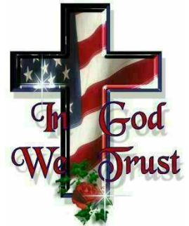
WHERE TWO OR MORE....

PRAYER FOR VOCATIONS: : O God, you chose the apostles to make disciples of all nations and by baptism and confirmation have called all of us to build up your Church. We implore you to choose from among us, your children, many priests, deacons, brothers and sisters, who will love you with their whole heart and gladly spend their entire lives making you known and loved by all. Amen