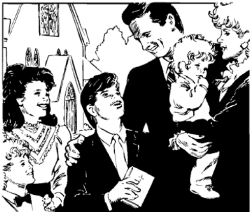
AUGUST IS FAMILY MONTH

NON-PROFIT ORGANIZATION US POSTAGE PAID PERMIT NO. 346 CARMICHAEL, CA 95608