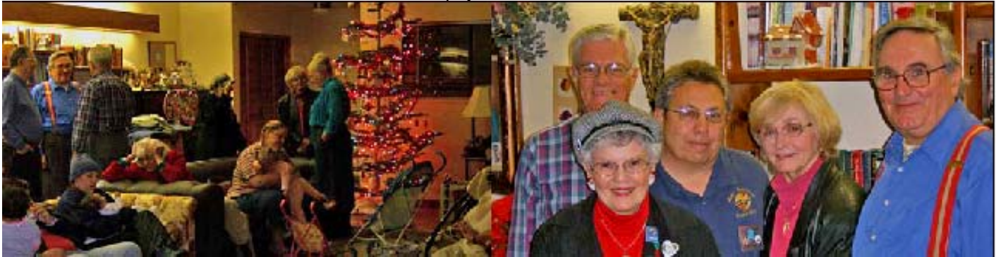
PICTURES FROM OUR 2005 DONATIONS TO THE BISHOP GALLEGOS MATERNITY HOME