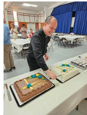
The Blessing of the Cakes and Cupcakes