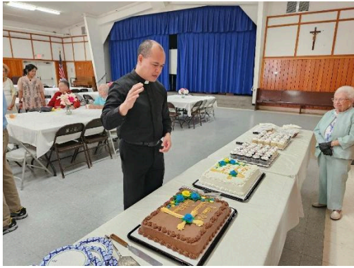
The Blessing of the Cakes and Cupcakes