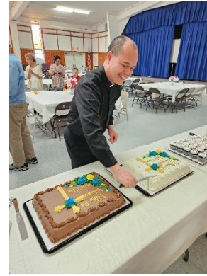
Slicing the Cakes