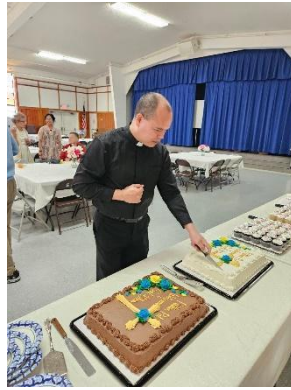
Slicing the Cakes