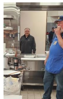
Father Blesses from a safe distance.