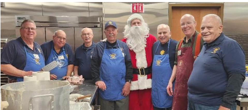
The crew takes advantage of this opportunity to whisper their own desires to Santa.