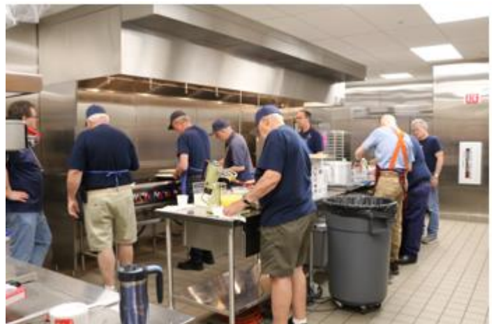
Brothers hard at work in the kitchen