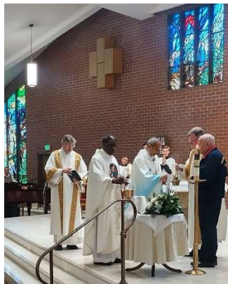
Incensing the Cremains