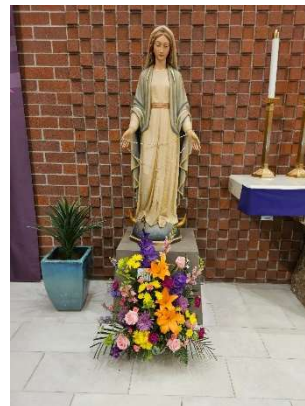
Flowers for Our Lady