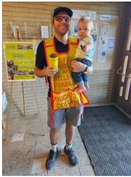
“Tootsie” Volunteers - SI