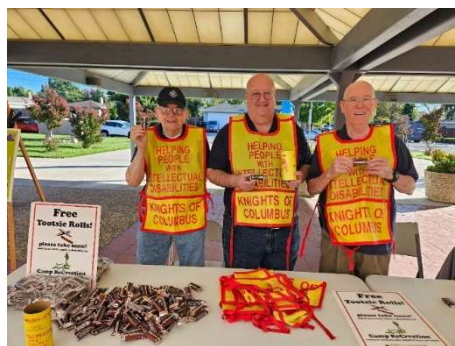
“Tootsie” Command Center & “Tootsie Brothers” - OLA