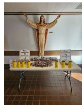
“Tootsie” Command Center - SJE