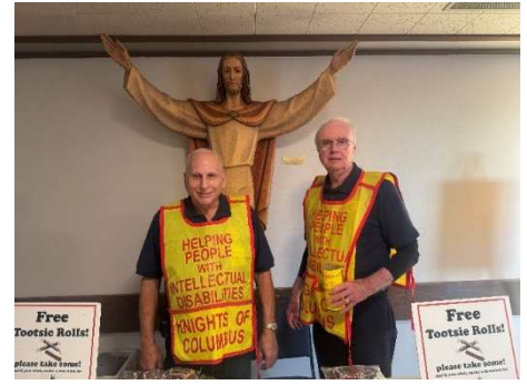
“Tootsie Brothers” - SJE