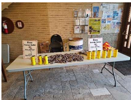
“Tootsie” Command Center - SI