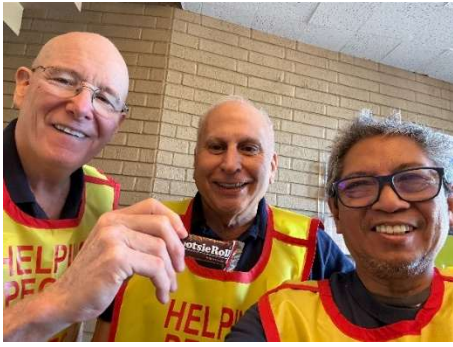
“Tootsie Brothers” - SI