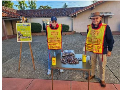
“Tootsie Brothers” – OLA (side door)