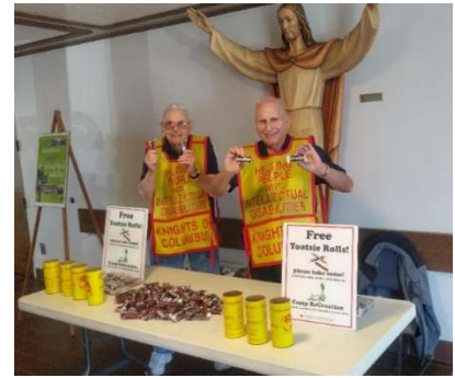
“Tootsie Brothers” - SJE