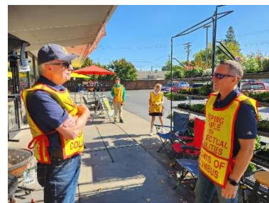
"Tootsie Brothers" & Kids at EH