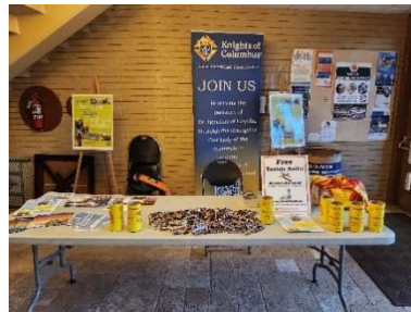
Membership and Candy at SI