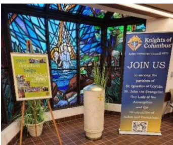
Promotional signage at SJE