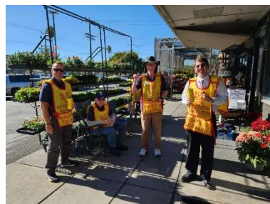
"Tootsie Brothers" at EH