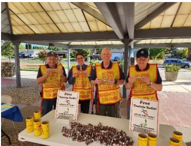
"Tootsie Brothers" at OLA