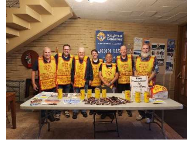
St. Ignatius of Loyola

Our 2023 Council 4970 ID Drive fundraiser for Camp ReCreation was off to a flying start in October. Our volunteer helpers, along with 5,400 individually wrapped Tootsie Rolls, donation cans, aprons and posters were ready to go. As usual, all that was needed were caring and generous donors and God provided hundreds of friendly supporters interested in helping to send individuals with developmental disabilities to Camp ReCreation at Eagle Lake. Besides the residential summer camp which offers participants opportunities for fun, social interaction and spiritual growth, the Camp ReCreation organization sponsors other events throughout the year in the greater Sacramento area.