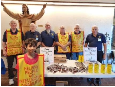
St. John the Evangelist