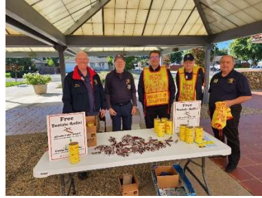
Our Lady of the Assumption